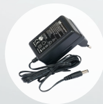
24V 0.8A Adapter